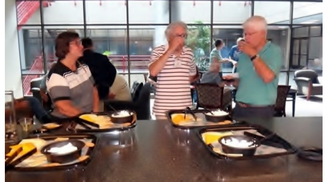
There were continual friendship discussions on-going in the UNISYS presentation center.