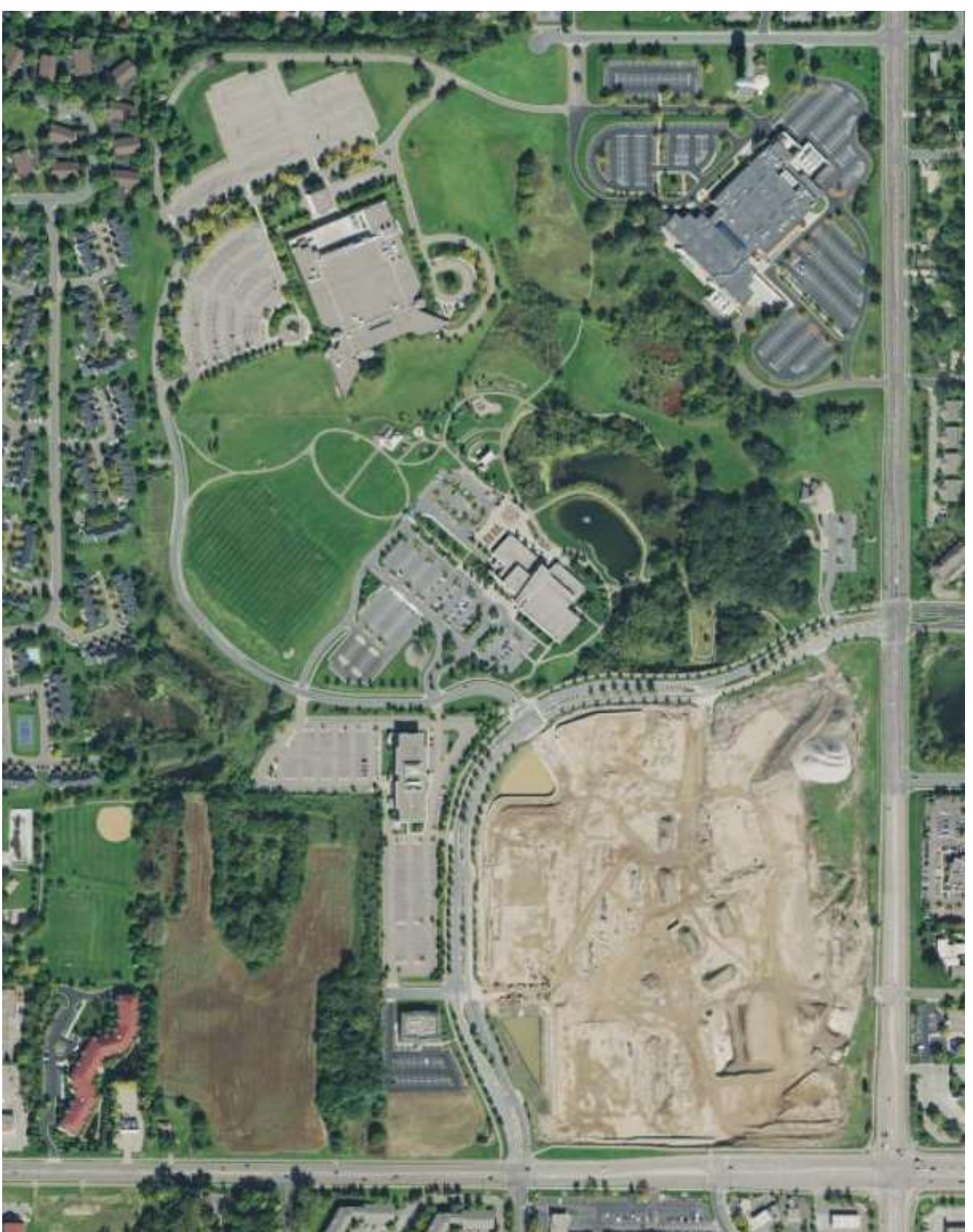
Pilot Knob & Yankee Doodle -2015 Building Tear Down Page 8 of 9