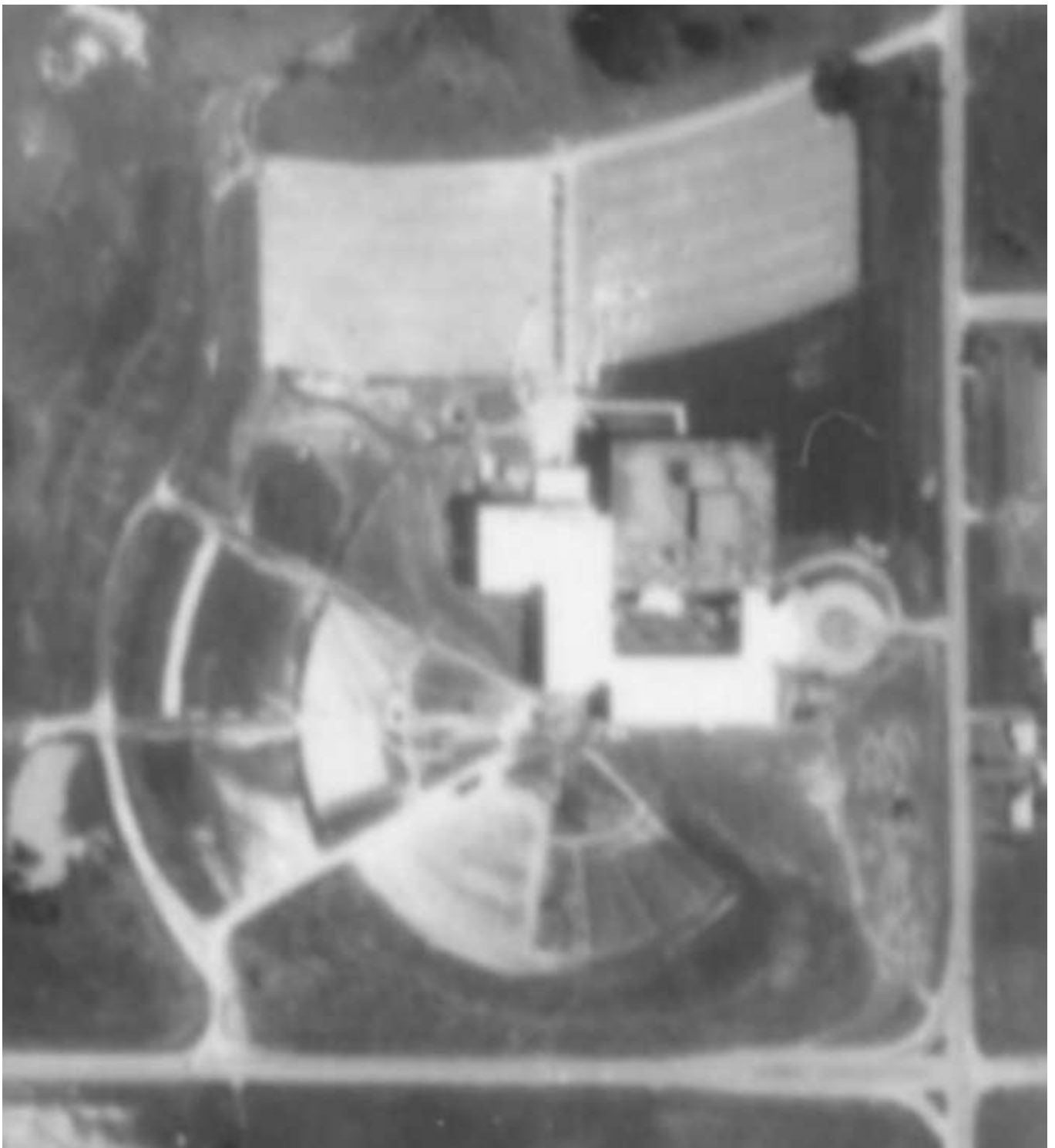
Pilot Knob & Yankee Doodle -1974 Building With Additions Added