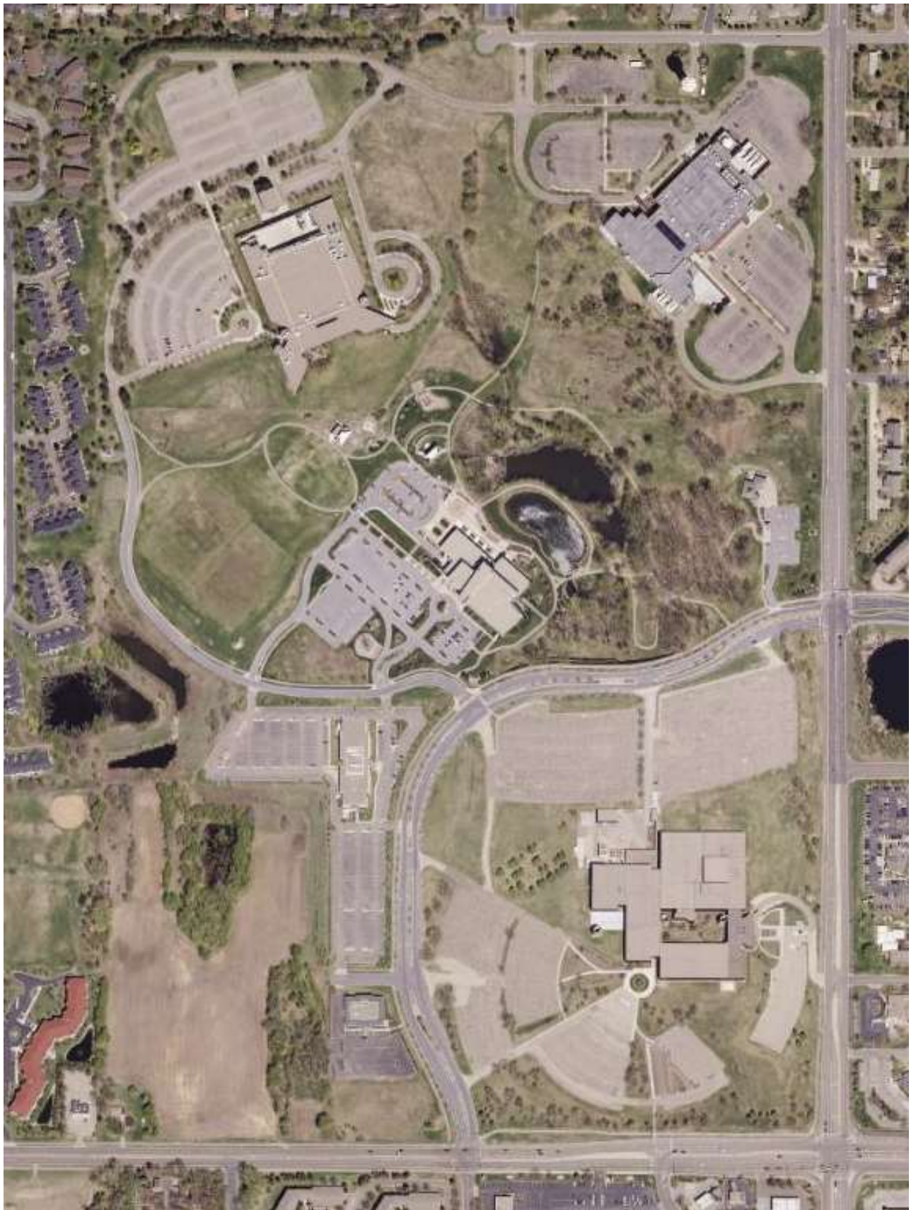
Pilot Knob & Yankee Doodle -2013 Lockheed Parking Lots Empty Page 7 of 9