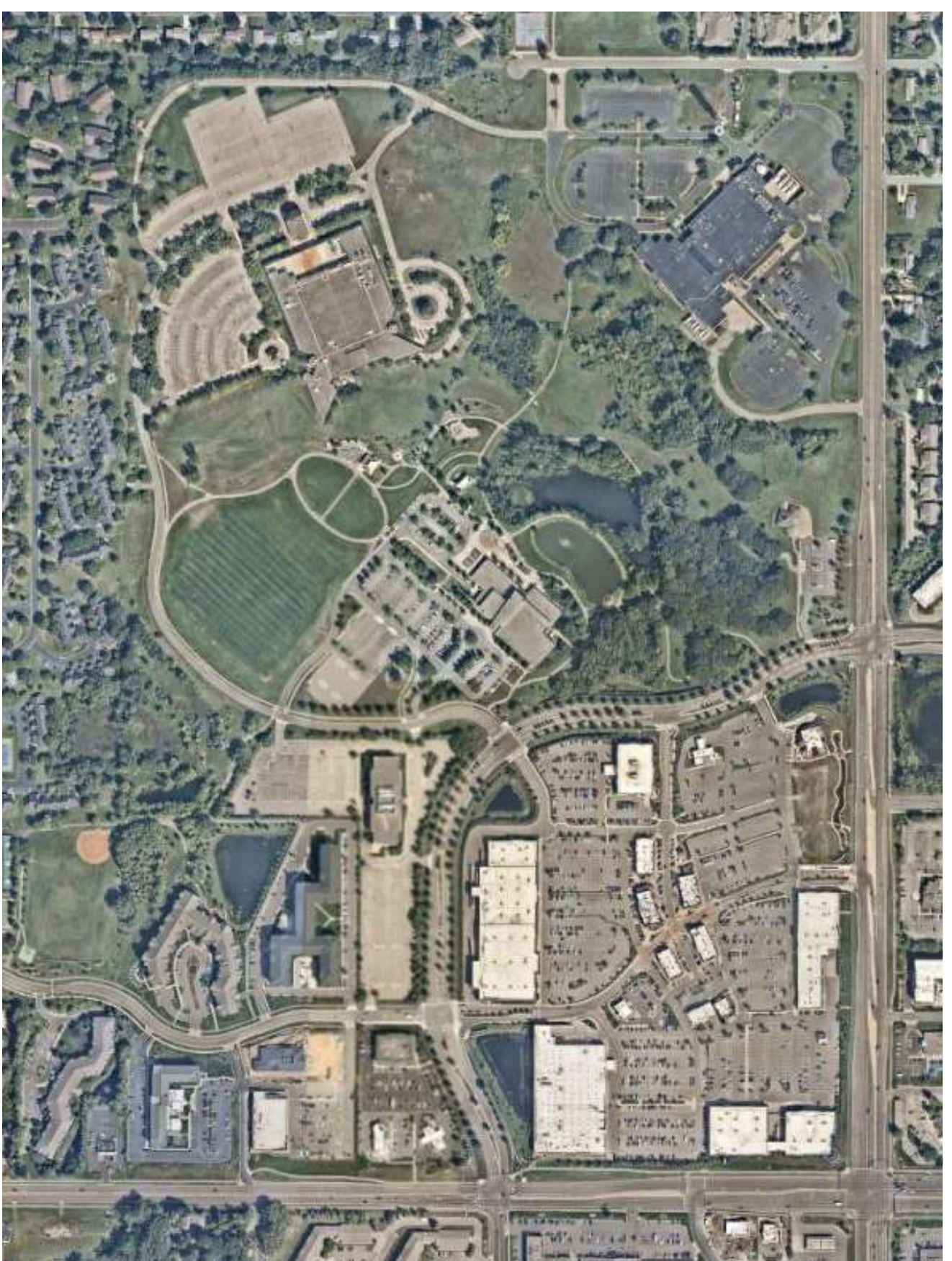
Pilot Knob & Yankee Doodle -2023 Shopping Mall Page 9 of 9