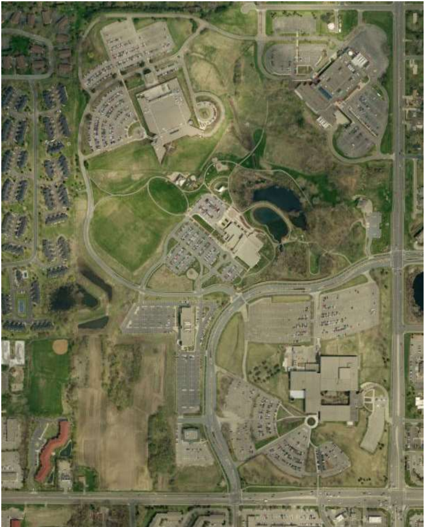
Pilot Knob & Yankee Doodle -2012 Still Cars In Parking Lot Page 6 of 9