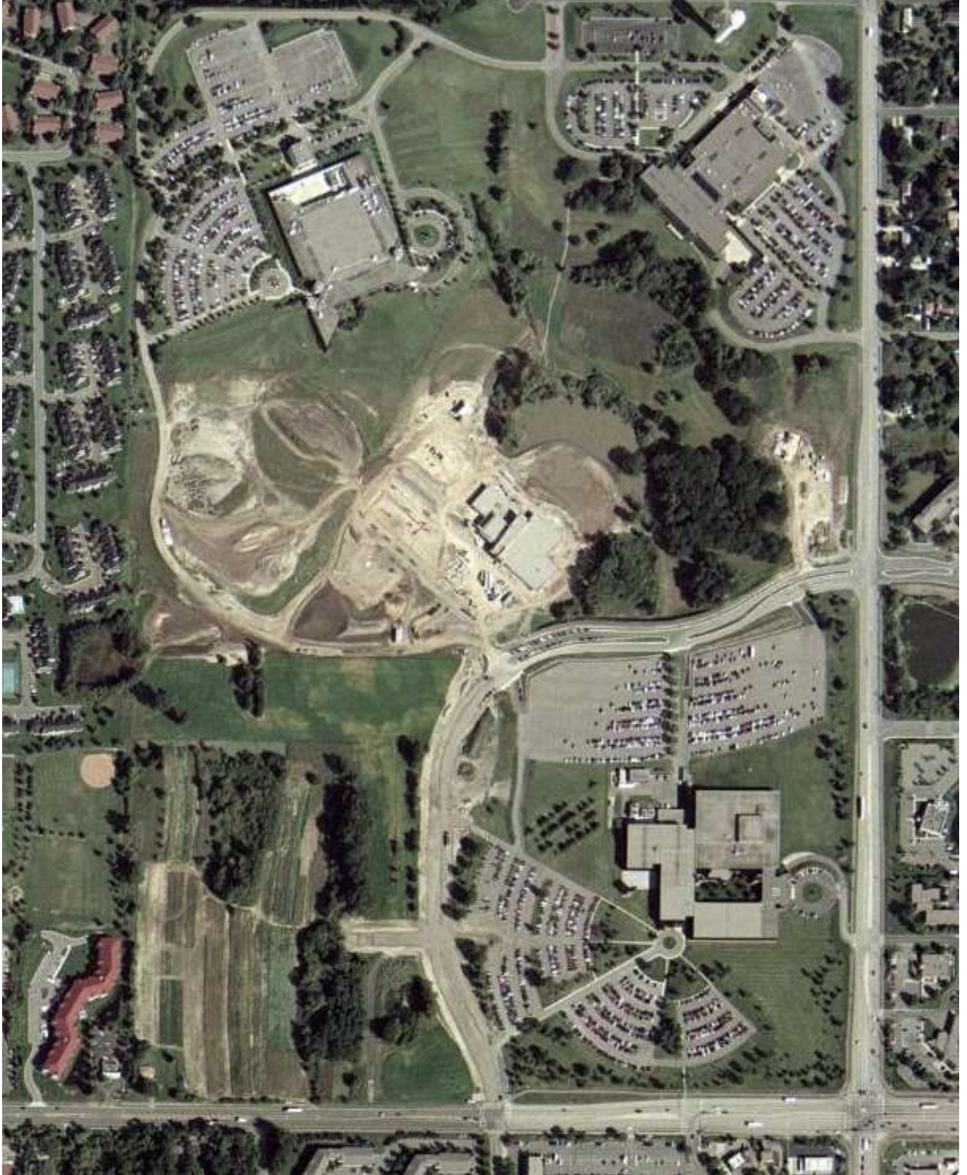
Pilot Knob & Yankee Doodle -2002 Egan Community Center Construction Full Parking Lots Lockheed & Unisys Buildings