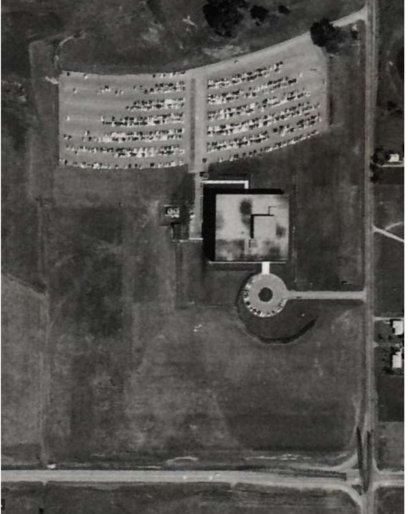
Pilot Knob & Yankee Doodle -1970 Original Building Page 2 of 9