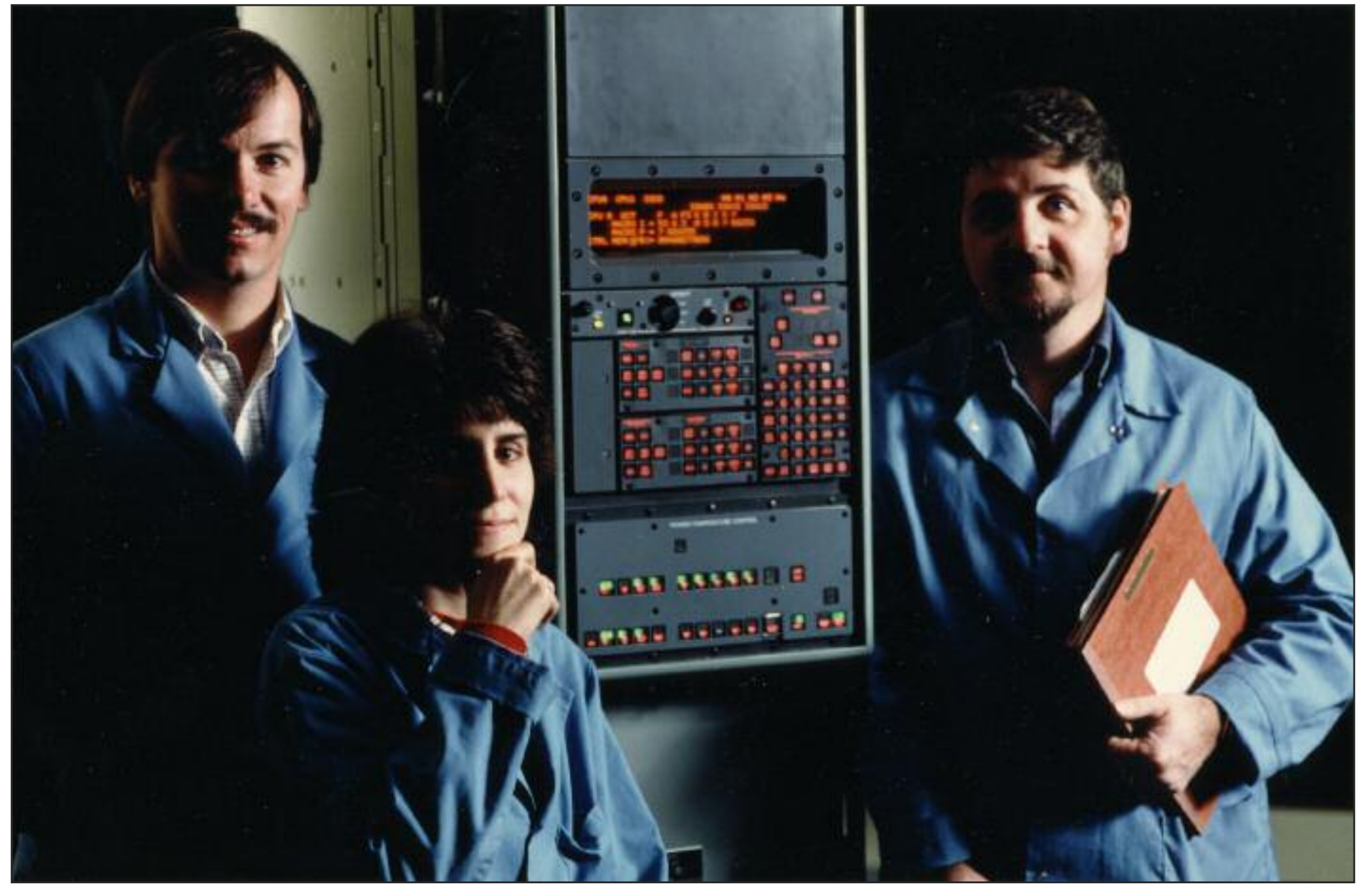
Right: Three company employees standing around an AN/UYK-43, the third-generation NTDS computer. First put to use in 1984 these computers are gradually being replaced by AN/UYQ-70 units. However some UYK-43s will remain in service into the 2020s.

While early incarnations of UNIVAC's Naval Tactical Data (NTDS) system were successful, later versions proved to be just as capable, even exceeding expectations. The third generation of the NTDS system was the AN/UYK-43 computer. Designed at the Eagan plant, it allowed for numerous technology upgrades over its lifetime and was designed to fit onto the same mounting bolts as its predecessor, simplifying replacement. Coupled with the next generation naval minicomputer, the AN/UYK-44, these machines provided computing power to the Navy for several decades, on ships and submarines.