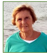
Old Timers' Reunion, November 2, Lost Spur Golf and Event Center