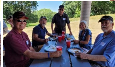
C-U-T- - -H-E-R-E