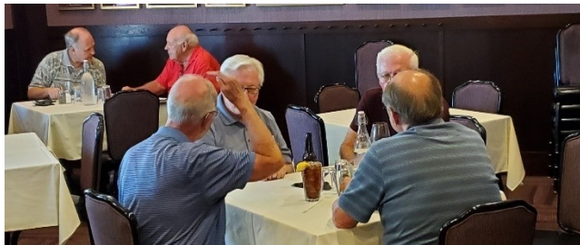
☺ Hairline comparisons? ☺

Happy Hour on September 18 th at Jensen's in Eagan. We had 62 sign ups as "Yes" and 12 sign ups as "Maybe". 11 "Yes's" were no shows and 11 "Maybe's" did not show up. There was 1 "walk-in" giving us 53 attendees. We had committed to and paid for an hors d' oeuvres order for 65 attendees. There were 211 Evite "No" replies, and 83 invitees who did not even view the Evite. The Evite system is very good in that it gave us a lot of information and made communication very easy for the event coordinator.