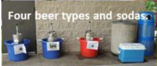
Four beer types and sodas.