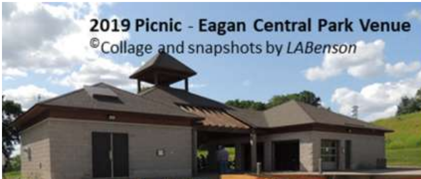
2019 Picnic - Eagan Central Park Venue