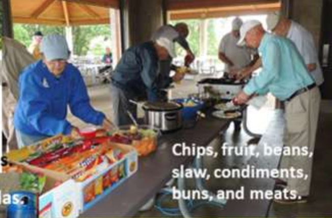
Chips, fruit, beans, slaw, condiments, buns, and meats.