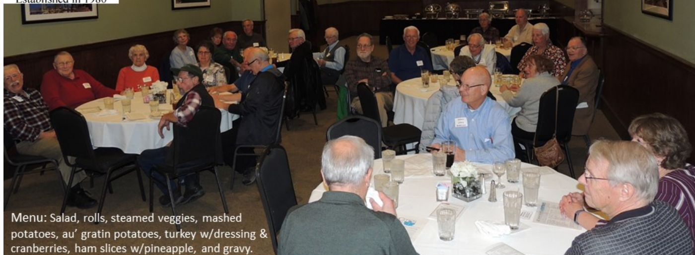
Menu: Salad, rolls, steamed veggies, mashed potatoes, au' gratin potatoes, turkey w/dressing & cranberries, ham slices w/pineapple, and gravy.