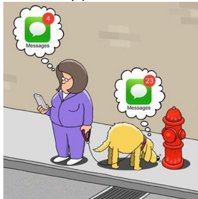
3. Original source unknown!