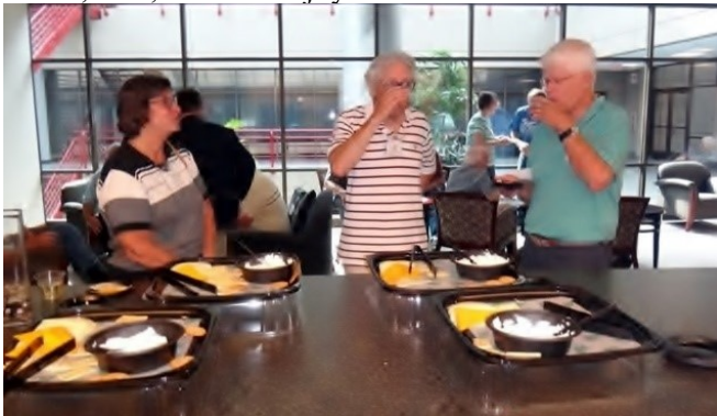
There were continual friendship discussions on-going in the UNISYS presentation center.