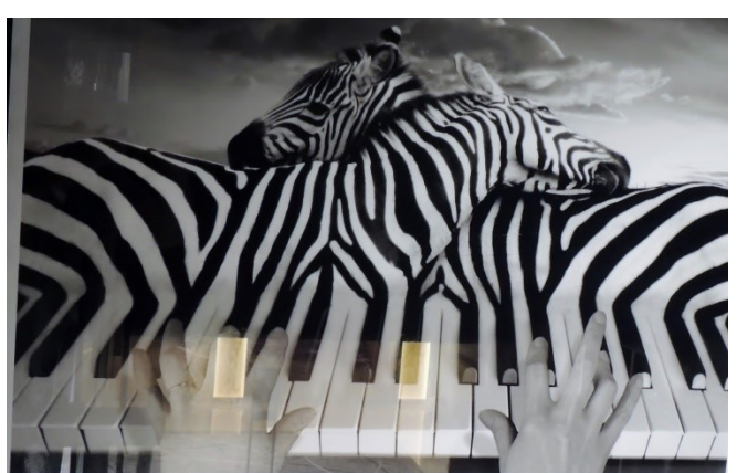
Koningsdam art display

Hooked! It was raining hard and a big puddle had formed in front of the little Irish Pub. An old man stood beside the puddle holding a stick with a string on the end and jiggled it up and down in the water.