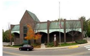
April 15, 2015