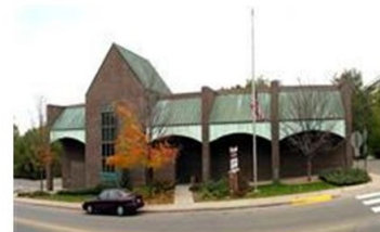
April 15, 2015