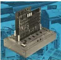
Cover of manual

This system was built with an interface based on plans shown in the June 1972 MCS-8 manual to connect the SIM8-01 to the MP7-02 programmer and a teletype. In the Nov. 1972 release, Intel provided the hardware to interface the system. It was called the MCB8-10 and was shown on the cover of the manual. Nearly all known systems look like these shown below.