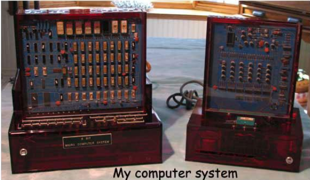
My computer system