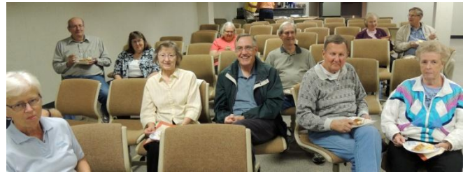
Pie and Ice Cream snapshots – send me a note if you'd like to get a *.jpg copy of any photo.