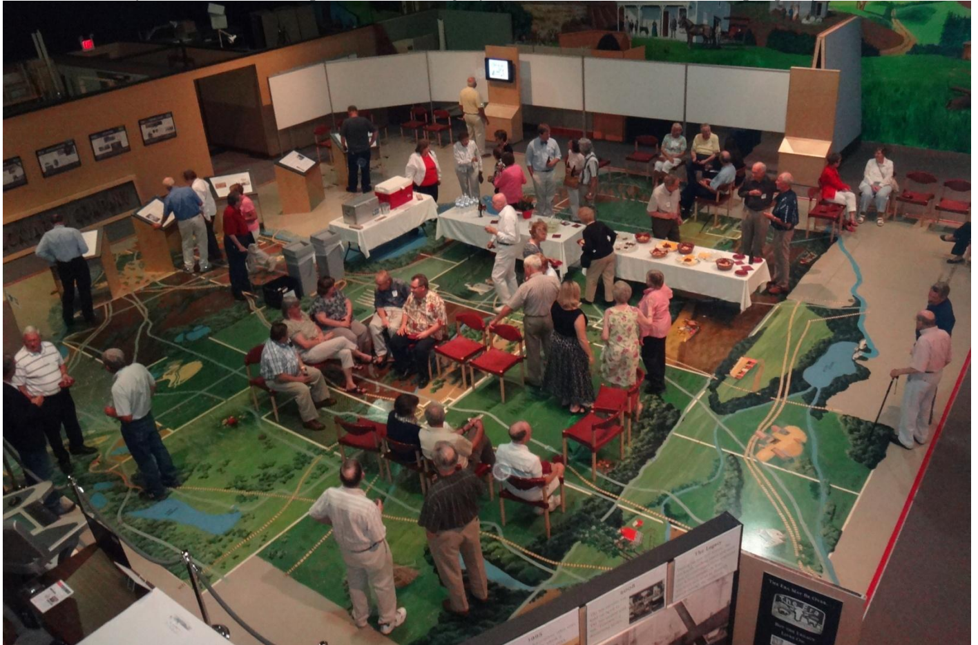
Keith Myhre and Bernie have also provided photos of the exhibits, to be part of the October web site article.

As illustrated in the page wide photo below; the floor of the Lawshe Museum exhibit is painted as a geographic layout of Dakota County – roads, rivers, and ponds. Our IT Legacy exhibit stations are around the periphery of the room.