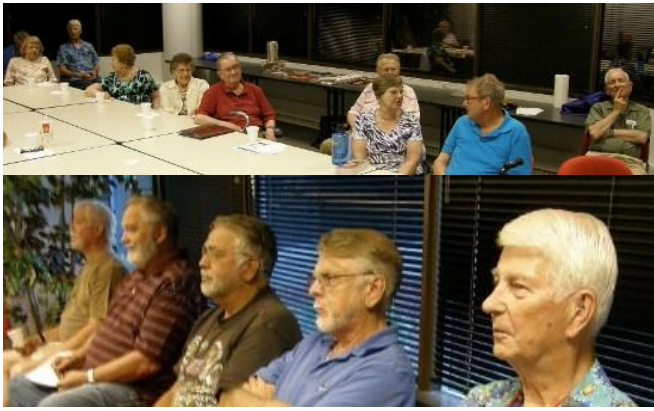
Program Snapshots

Wine and Cheese Social: Over 60 Club and DCHS Board members participated in the “From ERA to Lockheed Martin: Minnesota’s Computer Industry” exhibit preview on August 13 th . This hardware exhibit is a great and significant milestone for the IT Legacy committee which has been gathering and cataloging documents and artifacts since October 2005.