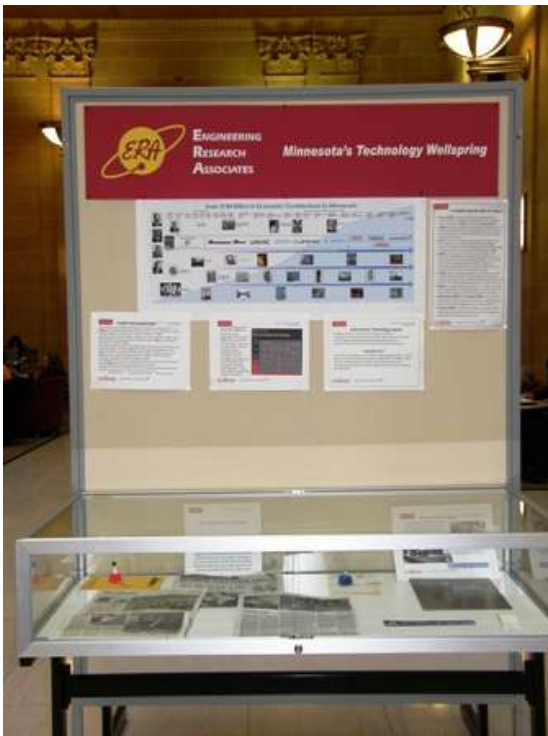
Photo 3 shows the first two decades of our computer genealogy as hardware advancements in one generation pushed ingenuity and inventiveness onto the next generation. This process has been uninterrupted and continues today.

Photo 2 shows the primary side of the display which contains two large posters generated by VIP Club sponsor Lockheed Martin. The family history (ancestor chart) of Unisys is also displayed here with roots going back through Sperry and Burroughs to Remington and other originators. Another interesting "time-lined" chart shows our corporate interactions with the University from 1958 to the present. In the display case are significant hardware artifacts (or photos thereof) as well as newspaper articles, photos, booklets and books drawn from and attesting to our legacy.