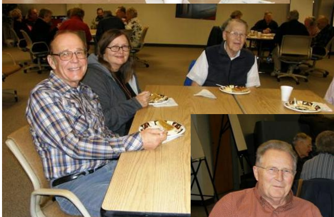
October 14, 2008