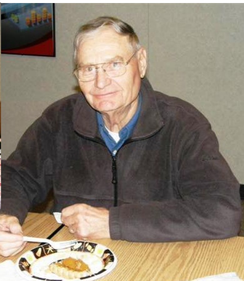
Pies were GREAT!