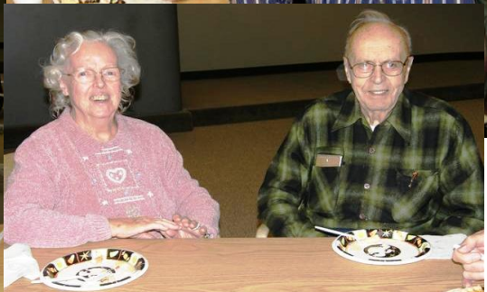
*.jpg images available, e-mail webmaster@vipclubmn.org