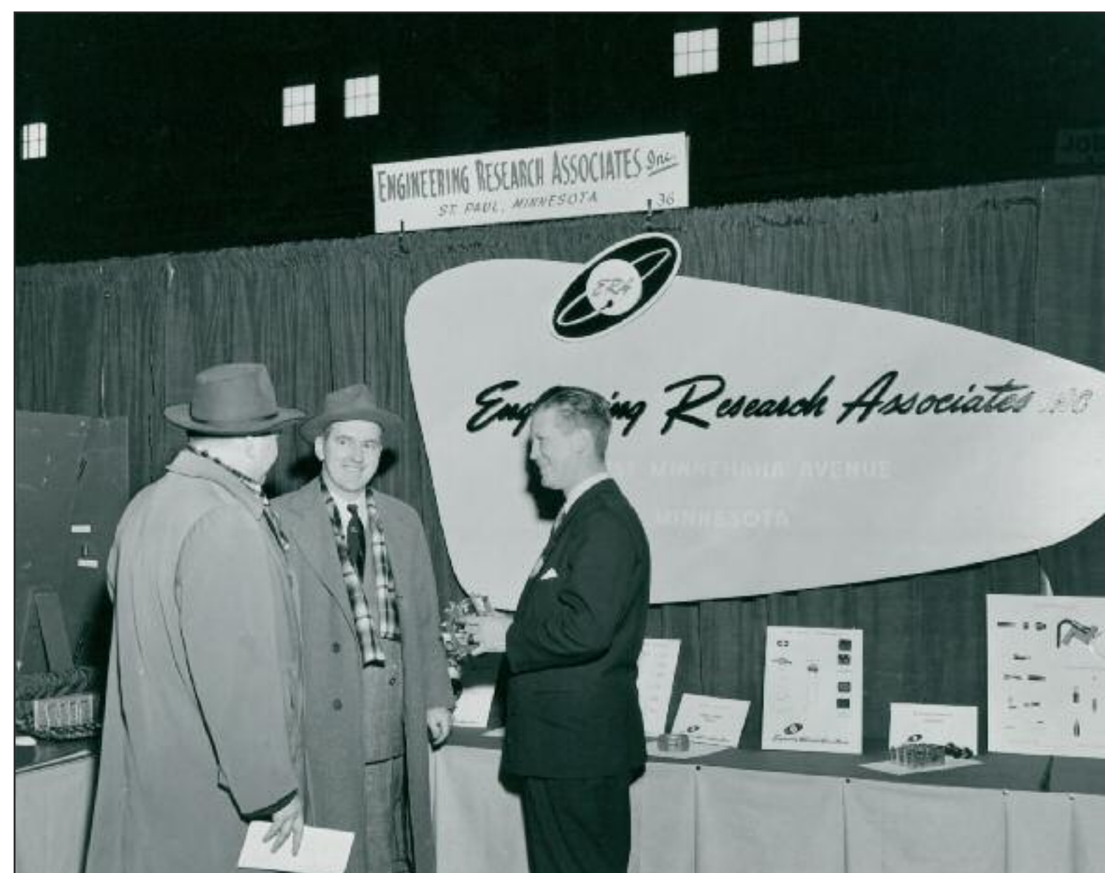
Above: An ERA representative at a trade show in the early 1950s. Many of the company's products were produced for the U.S. Military and were classified, completely unknown to the public until years later.

This exhibit tells the story of ERA and its many successor companies, their many products and systems, and the profound impact they have had on the economy of Minnesota, and the United States.