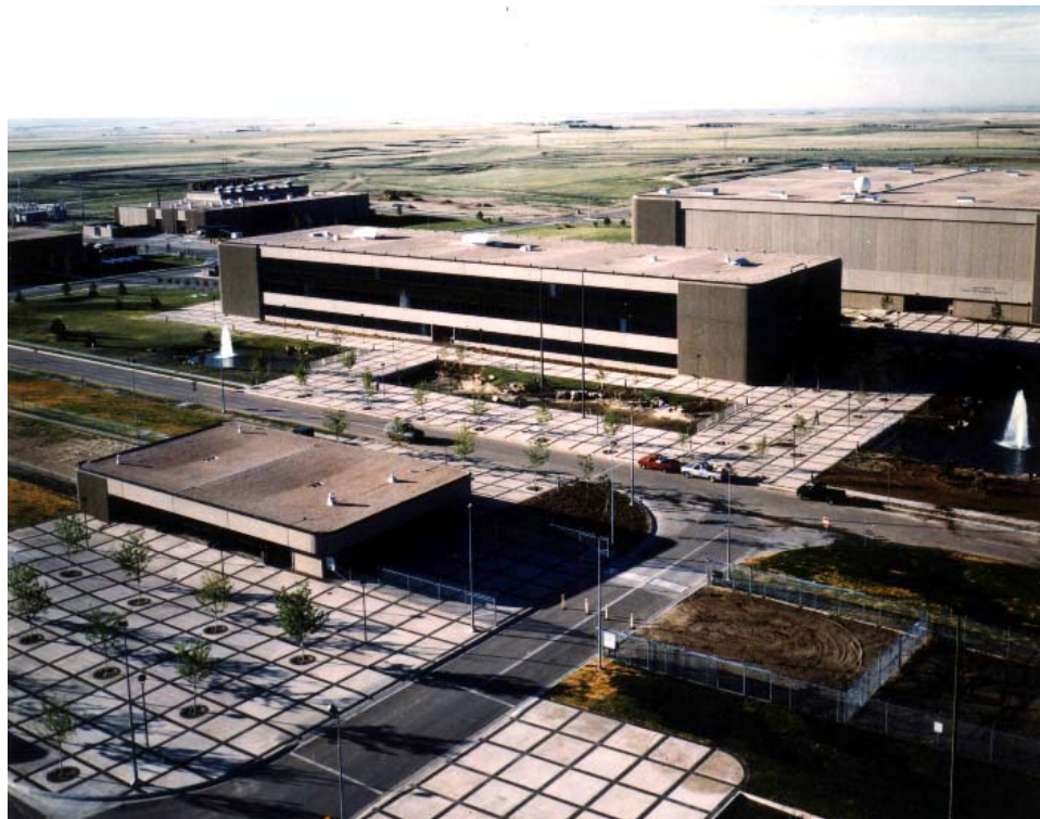
The Consolidated Space Operations Center (CSOC), now the headquarters of Air Force Space Command's 50 th Space Wing, is shown soon after its completion. SMC developed, built, and tested this satellite control node and its support facilities, turning the complex over to Air Force Space Command in 1993.

The hardware and software used in the AFSCN has undergone numerous upgrades during the last four decades. One of the most significant upgrades was the Data Systems Modernization (DSM) program, which introduced state-of-the-art computer hardware and software to perform command and control of orbiting satellites. The program was initiated in 1980, and by February 1992, the new system was able to perform all of the functions needed to support the satellites then in orbit. DSM was more reliable than the old system, cheaper to maintain, and faster in its operation, allowing it to support a steadily increasing satellite support workload.