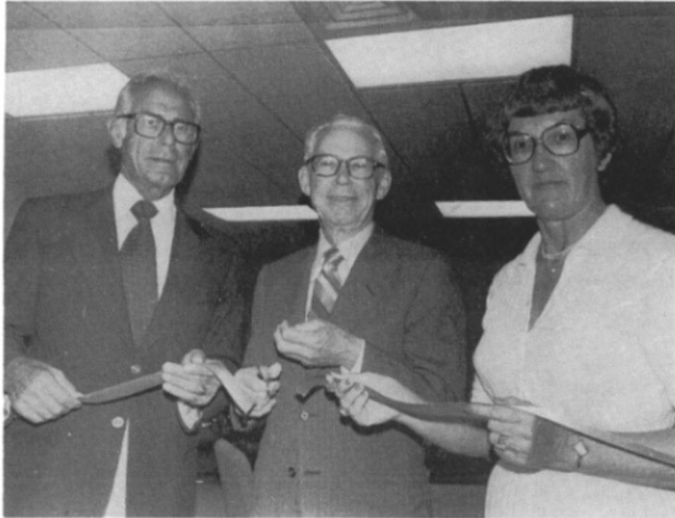
Cutting the Ribbon