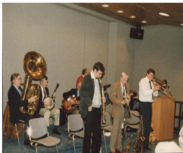
Jazz Band at the Club