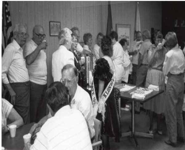
Klondike Kate Night at the Club