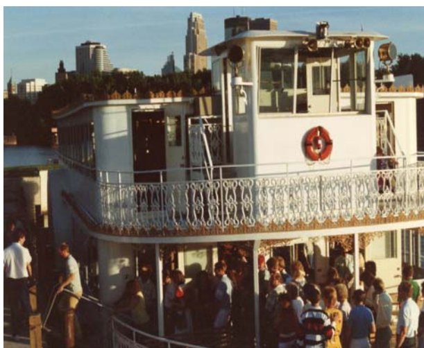
Mississippi River Boat Cruise

Excursions and Outings – Club members, over the years, have been active, enthusiastic partakers of local excursions as well as more distant travels and outings. These have included trips to the Janisch Brothers farm in Wisconsin to enjoy the collection and processing of maple syrup; overnight casino/theater bus trips; St. Croix River boat and bus trips; river boat cruises on the Mississippi; horse racing at Canterbury Park and many other enjoyable events.