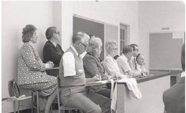
William Mitchell Law School Student Case Presentation Review