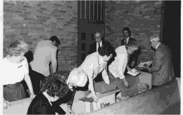
Ushering for St. Paul Chamber Orchestra, May 1983, United Church of Christ