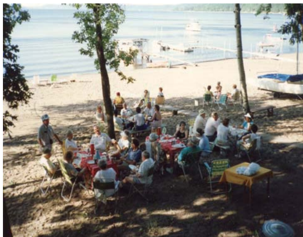
On the St. Croix

Picnics - The annual picnic is probably the most highly attended and anticipated event of the club. Picnics including golf outings, camp outs and pool parties have been held at various venues throughout the years with the Highland Park in St. Paul being the most recent and longest running spot.